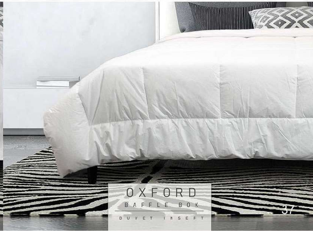
OXFORD BAFFLE BOX DUVET INSERT